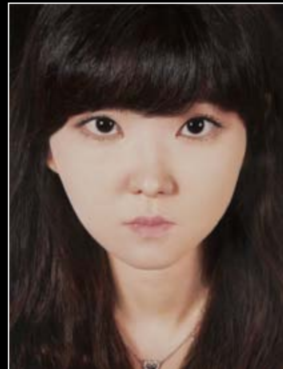
Hyelim - Oil on canvas - 116x91