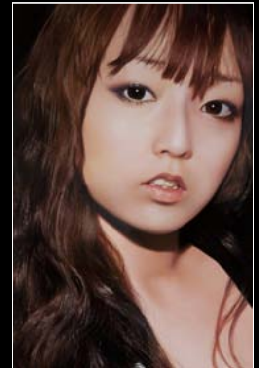
JiHyun - Oil on canvas - 194x112