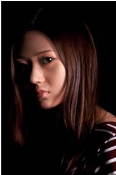
J.H.Wee - Oil on canvas - 194x130